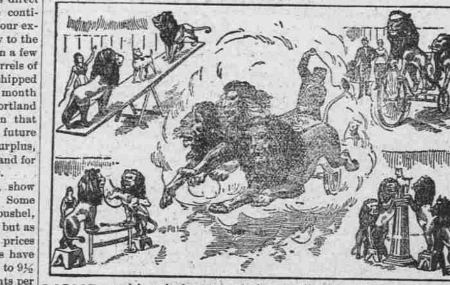
LIONS are driven in harness yoked to a chariot, made to form beautiful group tableaux, play see-saw, like children, with saxon, ride on tricycles expertly as human beings, play circus, hold objects, leap, and do several other MOST DIFFICULT AND NOVEL ACTS.

The Greatest Aerialists of All! THE CELEBRATED HANLON-VOLTERS. The supreme and exalted masters of their dangerous art. The highest salaried aerialists on all the great earth.