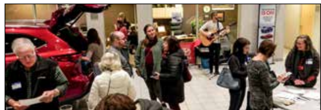
Guests circulate in the showroom at Columbia Gorge Honda and Toyota during a "vote for The Dalles" party in support of the Small Business Revolution voting challenge. As of Monday, the city ranked second in voting, which ended after deadline for this issue, on Tuesday Jan. 21.