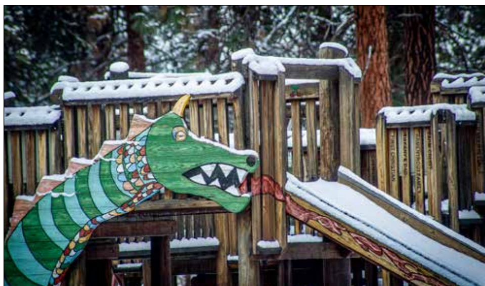
A "dragon" at Tree Top Play Park in The Dalles appears to mix fire and ice in an attempt to melt the snow on a park slide Wednesday. Cold temperatures and snow continued Thursday and were predicted for Friday as well. Additional moisture but warmer temperatures were forecast over the weekend and much of the coming week.

When temperatures drop, don't raise the thermostat higher than you normally would during more mild