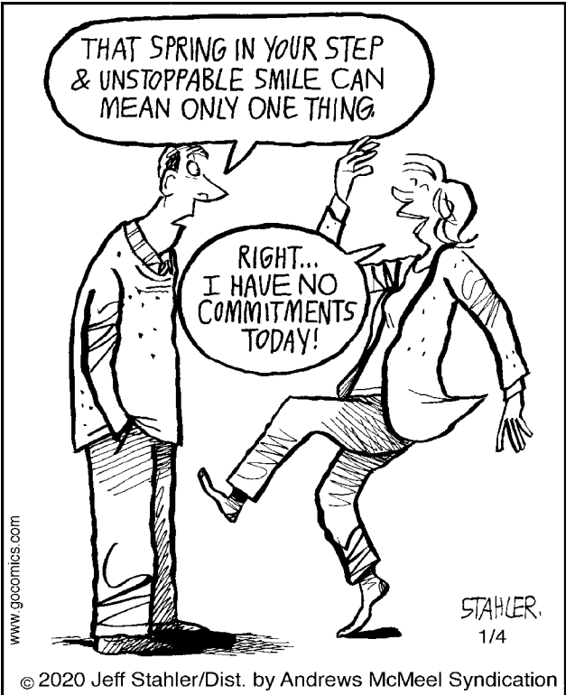
Moderately Confused by Jeff Stahler