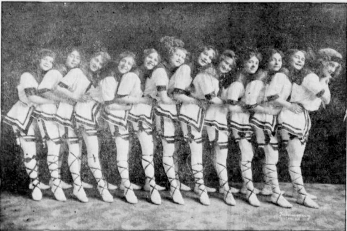
The Famous Armstrong Baby Dolls, who will be seen at the Lyric Theatre all week in the celebrated and much-talked of "Barefoot Dance."

Similar schools Seattle, Tacoma, Spokane.