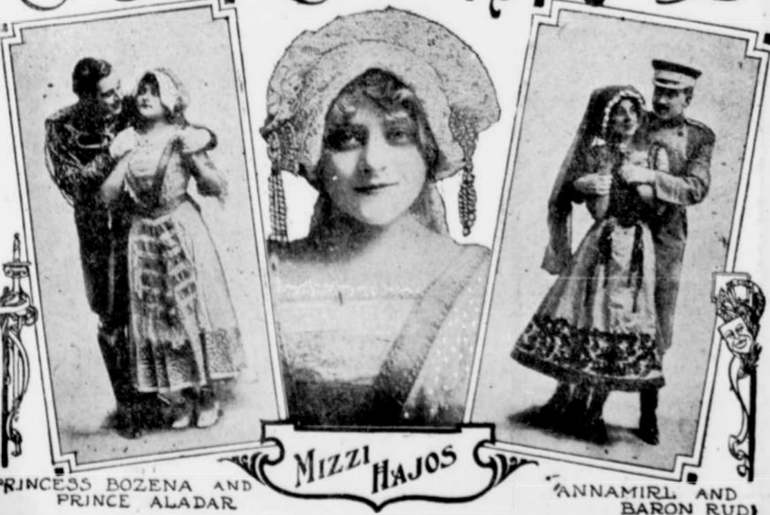
PRINCESS BOZENA AND PRINCE ALADAR