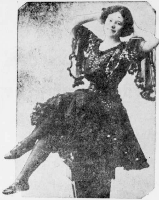
LARENA AT THE EMPRESS WEEK OF JUNE 6.