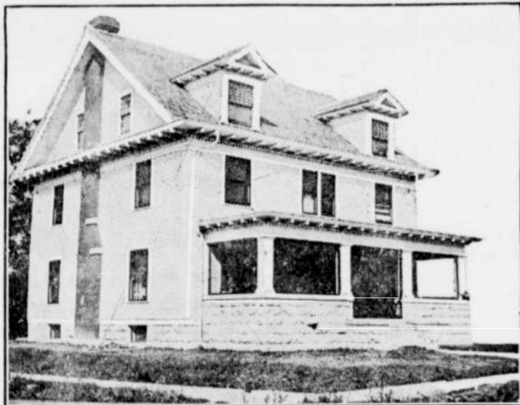
PERSPECTIVE VIEW—FROM A PHOTOGRAPH.