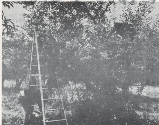
The students swarm all over the trees to get as many as they can.

Forty students from the life science classes harvested 150 boxes of apples from the Chemawa orchard during the second and third weeks of school. The apples were given to the Dining Hall for use during the school year.