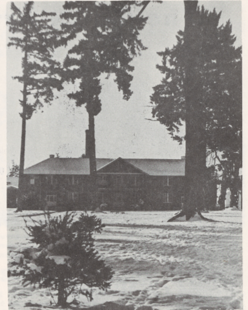
After the storm sun, shadow, trees and a building combine to produce a study in form and shade.