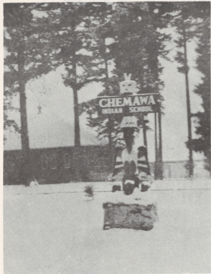
The totem pole wears a coat of winter white and seems to shiver as the snows trim it.