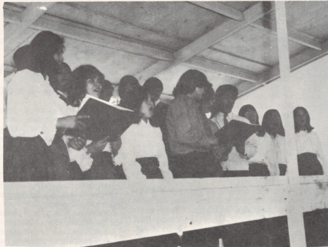
The choir sang for students, staff and guests.