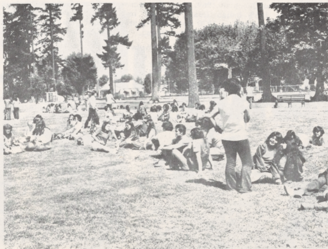
Some ate, some talked and some just sat around.