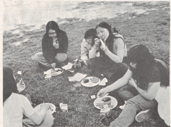
These chowhounds preferred food to music....