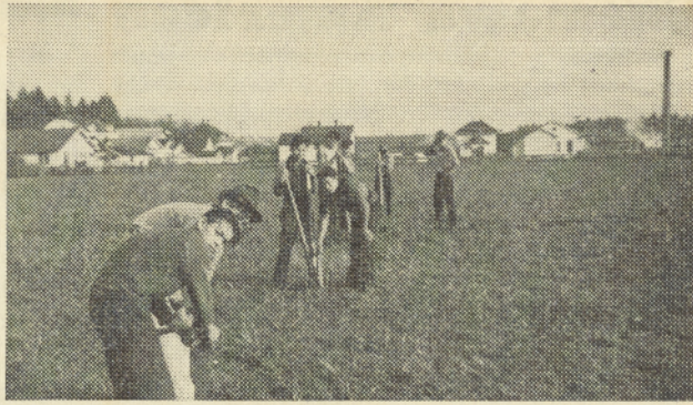
Boys digging post holes while laying out fence line for 4-H poultry pasture lots.