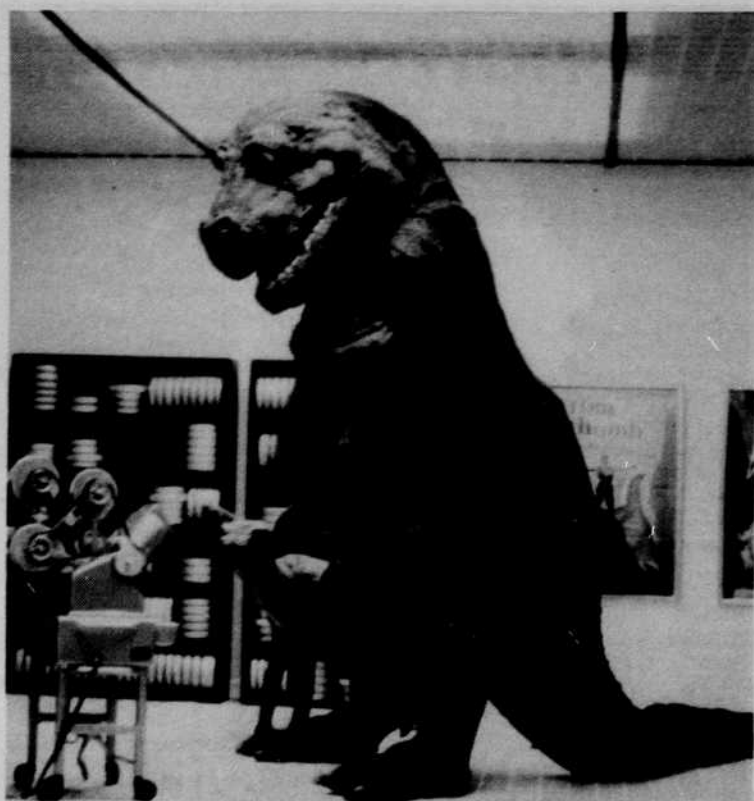
Arnie the Dinosaur reviews the Academy Award winning animation of George Pal in The Puppetoon Movie .