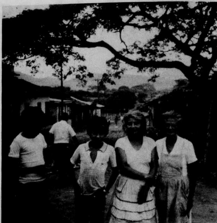
This photograph was taken at Estele, Nicaragua, near the area the Witness for Peace Delegation will visit.

The North Pacific delegation will take to Nicaragua 30 bags of material aid donated by people in the Northwest; other supplies will be shipped down by container via Seattle. Providence Hospital in Portland has donated $14,000 worth of medical supplies; people of the First Presbyterian Church in Sandpoint, Idaho, have donated baseball equipment. The Peace Club at South Eugene High School has raised money for school supplies; the most frequent request made of visitors by children in the streets of Nicaragua is a request for pencils. People of the First Presbyterian Church in Corvallis have sewn