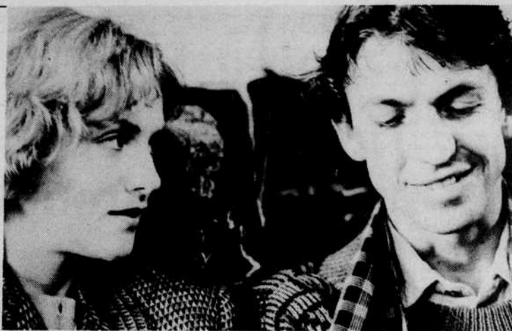
ABOVE: Cactus is by Australian director Paul Cox and plays September 1-3.

Winding up the festival in late September is Police (Sept. 22-24), French director Maurice Pialat's neo-realistic cops-and-drug-mafia thriller starring Gerard Depardieu. The Good Father (Sept. 22-24) from Great Britain's Mike Newell ( Dance With a Stranger ) stars Anthony Hopkins as a father separated from his son when his marriage falls apart. The last film, Law of Desire (Sept. 25-Oct. 1), is from Spain, and advance billing suggests that Pedro Almodovar has taken love and lust to new hilarious heights.