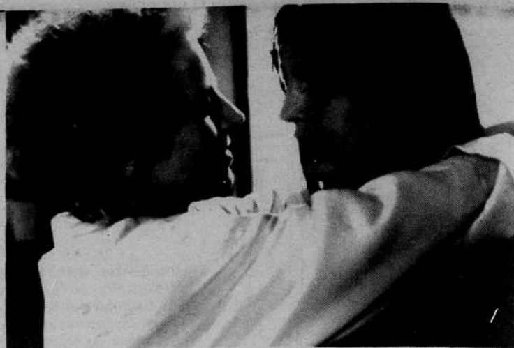
Hanna Schygulla and Angela Winkler in Margarethe von Trotta's "Sheer Madness," opening at the Bijou.