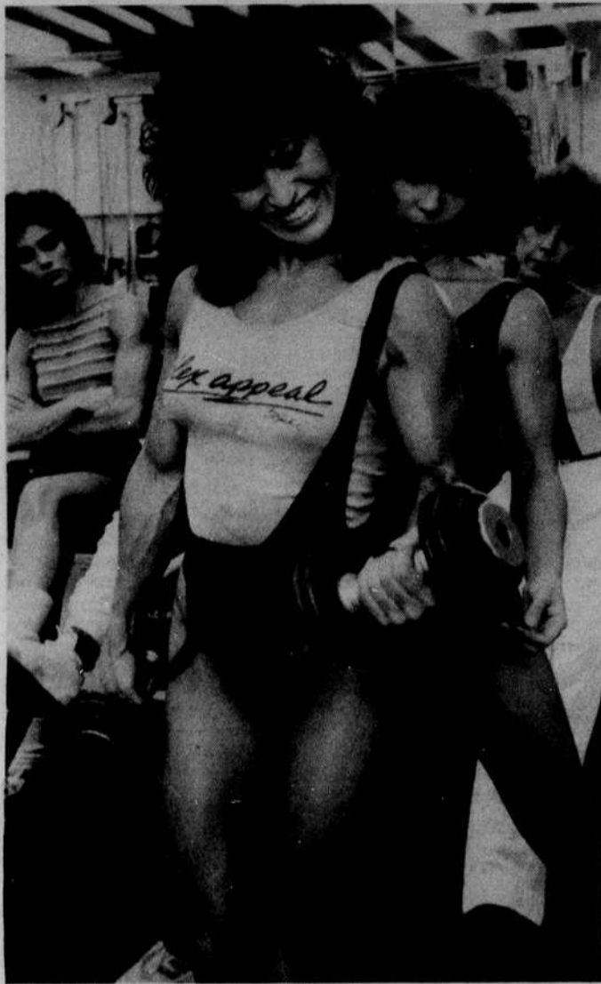
A scene from Pumping Iron II which starts Friday, August 2 at the Bijou Theater.