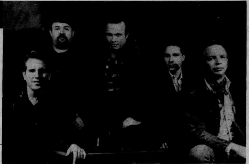
The Blasters play "gut-wrenching" rock and roll, rhythm and blues, and rockabilly in the UO/EMU Ballroom on Mon., Feb. 25.