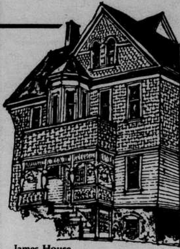
James House Port Townsend, WA

Few B & B's provide a telephone and television in every room. They generally offer more interesting amenities—bicycles, row boats, fishing tackle, hot tubs, picnic lunches and such. Oakley notes the amenities offered at each