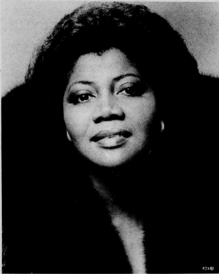
Mezzo-soprano Florence Quivar is one of the soloists performing at the Bach Festival. She will be heard in Beethoven's Missa Solemnis on Sat., July 7. She is one of America's most distinguished singers having appeared throughout the world.

It does indeed look like an exciting event Eugene should be proud of. Begun in 1970 as one performance and two workshops, the Festival is now respected throughout the country. Helmuth Rilling, artistic director and conductor, is recognized as one of the world's leading interpreters of Bach choral repertoire. He has directed throughout Europe, Japan, South America and the U.S. He also records extensively. The Festival orchestra consists of players from such major Ameri-