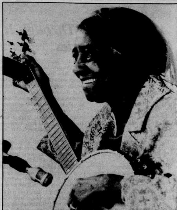
Elisabeth Cotton will be at the CCPA (WOW Hall) with Mike Seeger on Saturday, October 15th.