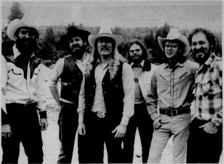
The Manzanita Band, playing rock, rhythm & blues, country swing, and reggae, provides music at a dance to benefit the Eugene Council for Human Rights in Latin America, Friday, July 8, 9 pm, at 1236 Kincaid. The Northern California group has played with Country Joe McDonald, and will also be at the Oregon Country Fair.