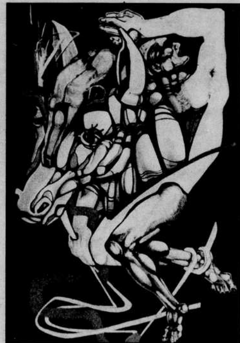
Paintings and sculptures by the eminent Russian artist and U of O humanist-in-residence Ernst Neizvestny will be on display at the U of O Museum of Art April 17-May 8. This exhibit is a part of a series of public humanities events entitled Freedom and Culture in the Soviet Union which begins the week of April 17. Watch for more details and a schedule of lectures, films, slide shows, and forums in next week's What's Happening.

Master Class in Baroque Music performance, 2:30 pm, Room 170 Music, UO. Free. NY Baroque Ensemble/Concert Royal teach.