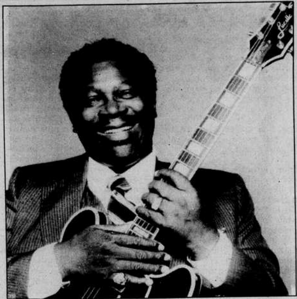
Blues artist B.B. King, with special guests The Paul Delay Band, perform at the Hult Center for the Performing Arts, Thursday, April 7, at 8 pm. Tickets are available at the EMU Main Desk and at the Hult Center Box Office.