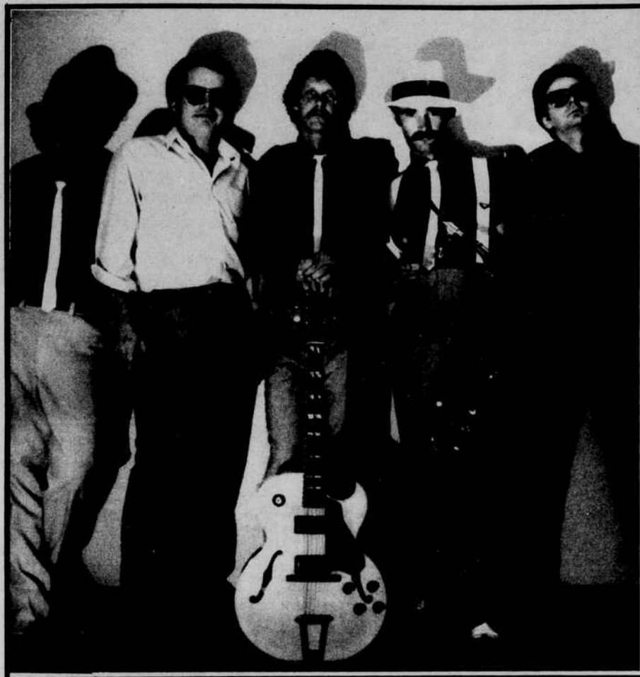
The Cyclones Blues Band plays hot Rhythm & Blues at the WOW Hall, Saturday, Jan. 22. See Saturday's listing for details.