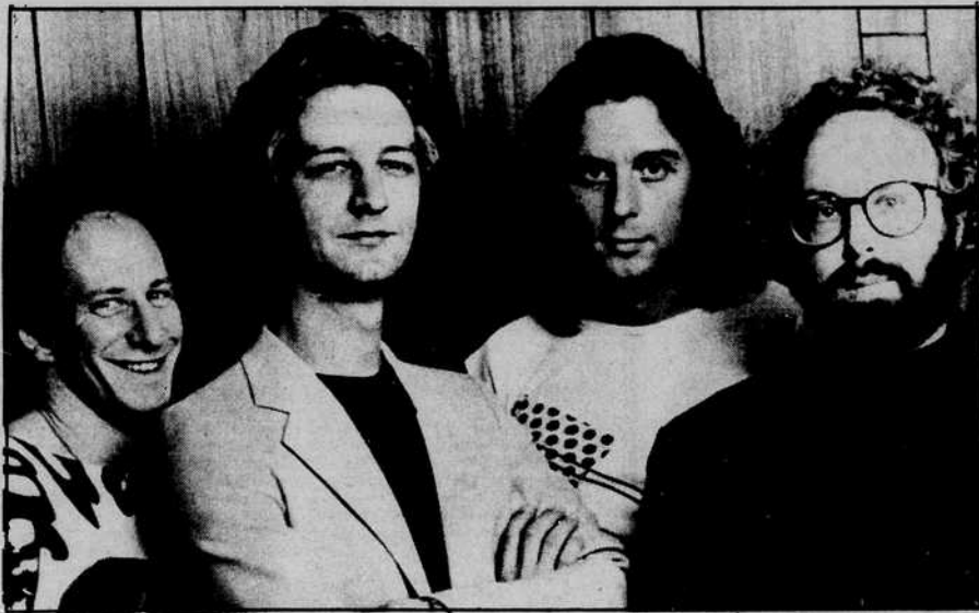
Shadowfax plays at the EMU Ballroom, Saturday, Jan. 15, at 8:30 pm. See Saturday's listing for details.