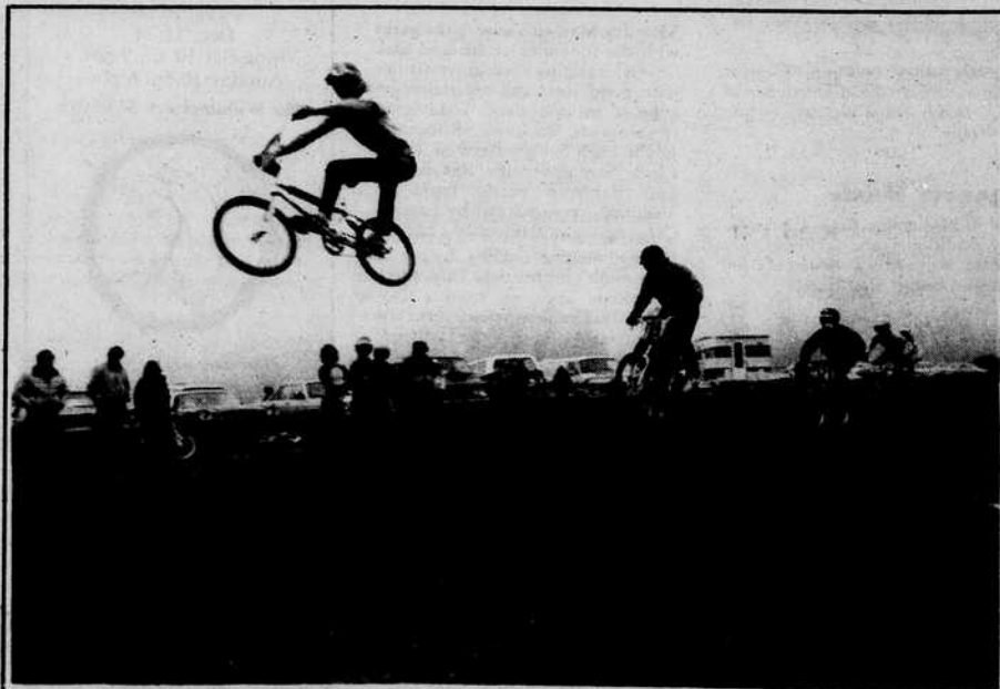
BMX—that's Bicycle Moto-Cross—has become a popular event for people of all ages. BMX happens twice each week behind the Autzen Stadium parking lot, Thursdays at 7 pm and Saturdays at noon. The entry fee is $3 on Thursdays and $5 on Saturdays. Awards are given for 1st-3rd places. This weekly event is sponsored by the American Bicycle Association.