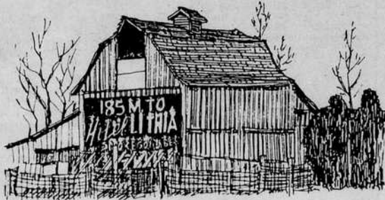
Printed with the permission of Ernie Drapela.