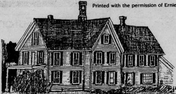
Printed with the permission of Ernie Drapela.

COBURG Terrain: Flat. Road Conditions: Good, some uneven places south of Armitage Park. Heavy traffic from Ferry St. Bridge to Belt Line. Total Distance: Leaving from and returning to Ferry St. Bridge: 24 miles. Comments: This route takes you through some of the orchard, farming, and grazing land in the Willamette Valley. Most days there are good views of the Coburg Hills to the east and the Coast Range to the west. Interesting architecture of Westminster Presbyterian Church. Many horses - some with colts in the springtime. Armitage State Park - picnic tables, water, toilets. Van Duyn Rd. deadends partway into the Coburg Hills. Good view across the valley into the Coast Range. Historical marker at old Territorial Rd. Old farm house with chimney marked "1877". There may be water on the road here if there have been heavy rains recently.