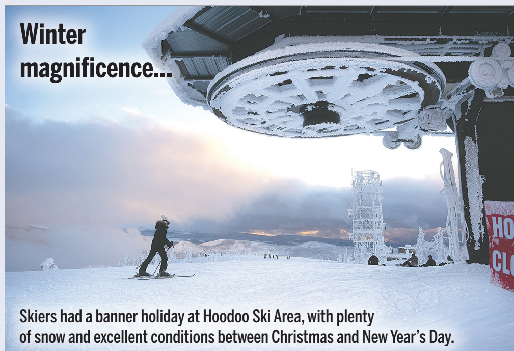
Skiers had a banner holiday at Hoodoo Ski Area, with plenty of snow and excellent conditions between Christmas and New Year's Day.