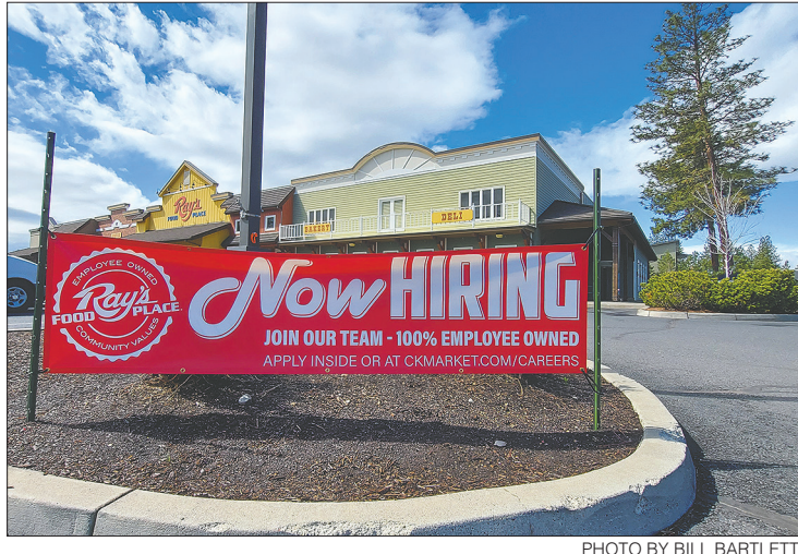
Businesses of all types in Sisters are struggling to fill job openings. Some are offering signing bonuses.

McDonald's is synonymous with entry-level jobs