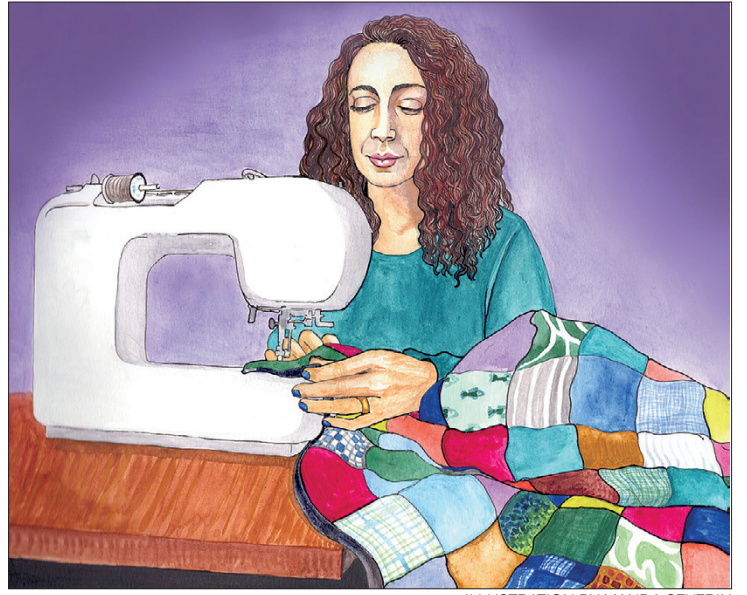
ILLUSTRATION BY MANDA SEVERIN

Punchy, garden-bright tomatoes and cool nighttime owls are among the site's recurring illustrations. Some are available as merchandise,