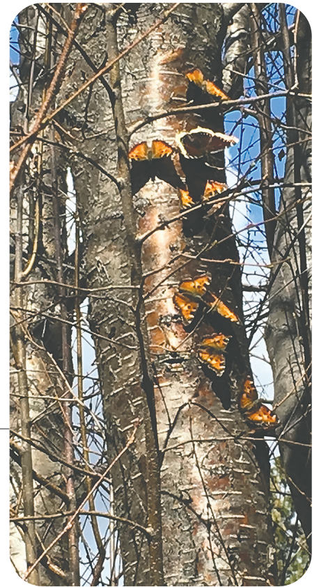
California Tortoiseshell butterflies make a stop in Sisters every April to sample the sap on the River Birch in my backyard. Their numbers are dwindling each year.

Now, while we are waiting for the snow to leave Black Butte, is a great time to do your homework by researching information about native plants suited to your landscape environment. You can start small; no need to tackle the whole yard at once. We can't change the world or stop climate change, but we can begin to restore the biodiversity in our own backyard and improve habitat for our crawling, winged, and four-footed neighbors.