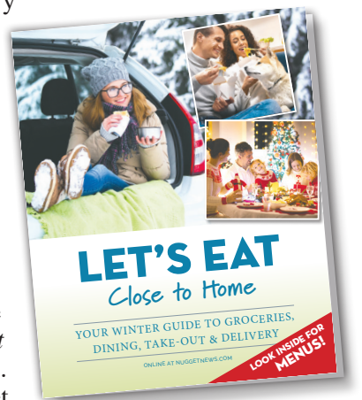
Look for Let's Eat Close to Home inside The Nugget on December 9; keep it to refer to all winter!

There is still time for restaurants, food carts, and purveyors of food products to get in the guide. Those who would like to participate can contact Vicki Curlett, The Nugget Newspaper's community marketing partner, at vicki@nuggetnews.com or 541-549-9941. Final space reservation deadline is Tuesday, November 24.