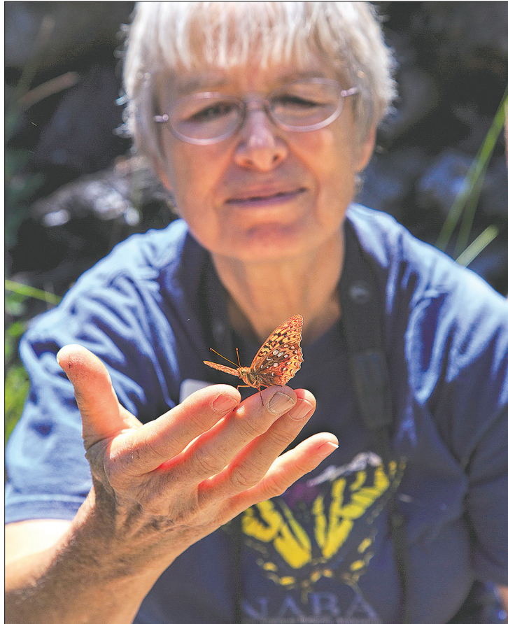
BY STEVE PEDERSEN

Today, cottonwoods are rare in their distribution across Central Oregon. It is this rarity, like the volunteers who stick with the