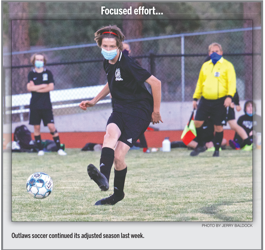
Outlaws soccer continued its adjusted season last week.

As it turned out, voters said “yes” by a comfortable margin, allowing the Library District to move forward with plans that will carry it well into the 21st century.