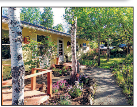
60734 BRISTOL WAY - BEND

11.5 acres slope gently to the northwest with great mountain views and high-desert beauty. Paved access, electricity and approval for a septic system, this acreage is ready for your Central Oregon dream home. The property offers views of Mt. Hood, Mt. Jefferson, Three Fingered Jack, Black Butte, Mt. Washington, Black Crater and the Three Sisters, plus elevated views of the surrounding area. There are adjacent parcels for sale on either side that expand the possibilities. BLM lands are nearby and the fishing is great along this stretch of the Middle Deschutes. $239,500. MLS#201910345