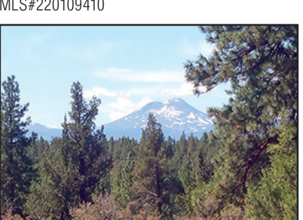
40 ACRES - 17672 WILT ROAD

Come visit this well-maintained single-level home on a private and spacious .46-acre lot. Character & charm are evident, inside & out. Surrounded by mature shade trees & shrubbery, providing exceptional privacy in this bird sanctuary. Updated ranch-style home with wonderful greatroom living area, enjoying bright, south-facing windows for natural light & wide-open living, dining & kitchen with eating/conversation island. Charming courtyard entry in the front. Large rear deck for outdoor enjoyment. Attached, fully insulated double garage with floored attic above. Great SE location just off Country Club Drive, with easy access to all parts of Bend & beyond. $450,000. MLS#220109410