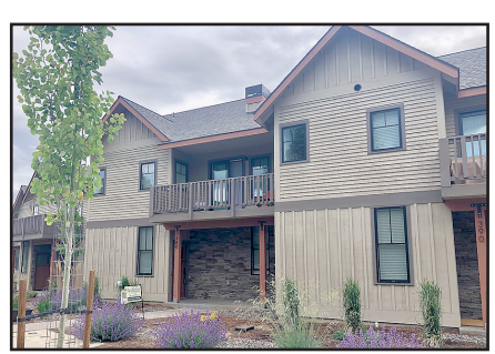
EXCITING NEW TOWNHOME

Creek front living! Build your dream home with the music of the creek in your backyard. Pines, willows, cottonwoods and natural grasses for your landscape. Play in the water on a hot summer day! Lot adjoins riparian park. No HOA dues! City water and sewer, so close to everything that Sisters Country has to offer. $245,000. MLS #220102859