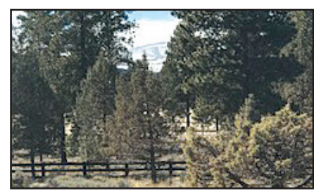
16676 JORDAN ROAD

A deautiful setting overlooking Aspen Lakes' loth Fairway with tee-to-green fairway views. The vista includes fairway ponds and a forested ridge/open space as the backdrop. Ponderosa pines and open skies highlight this large homesite ideal for your custom-home dreams. Underground utilities and water available, septic approval and close to Aspen Lakes Recreational Center. $299,500. MLS#220106225