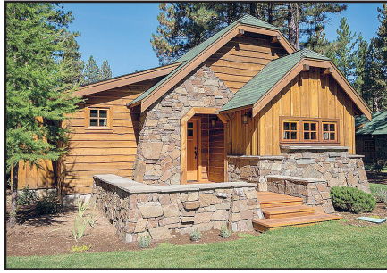
LAKE CREEK LODGE #26-U4

Located in The Peaks at Pine Meadow Village, Two bedrooms, 2 baths and 1,455 sq.ft. Contemporary style and design features upper-level living for privacy and view from the greatroom. Practical kitchen opens to a large spacious living/dining with vaulted ceilings and lots of windows to let the natural light in. Propane fireplace provides a cozy and warm living space in the cooler months. Ductless heat pump and lower-level radiant floor heating gives vear-round efficiency. Master is on the entry level and enjoys a large closet and luxurious bathroom. Guest suite is located off the greatroom, as well as an enjoyable upper-level patio to enjoy the outdoors. An auto courtyard leads to the attached garage. $432,500. MLS#202000020