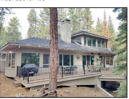
SPRING HOME #14

One-quarter share interest in this beautiful 3-bedroom, 3-bath cabin at historic Lake Creek Lodge in Camp Sherman. Features modern amenities with the feel of yesteryear. Built in 2014 and furnished with a combination of antiques and quality reproduction pieces, the cabin features fir-plank floors, knotty-pine paneling, stone/ gas fireplace, butcher-block countertops, gas cooktop, farm kitchen sink, tile bathroom floors & showers, washer/dryer, cedar decks, stone MLS#220107403