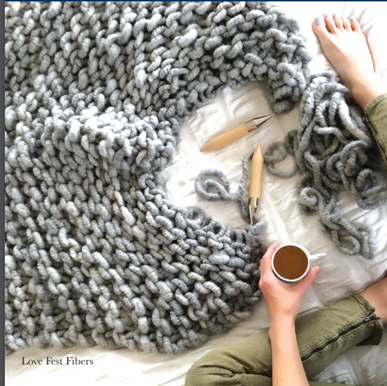
Love Fest Fibers