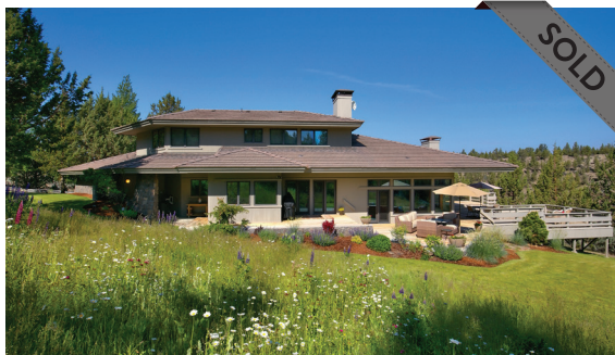
SISTERS OREGON 16611 Wilt Road #202001260 | $395,000