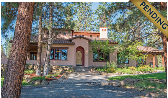
BEND OREGON 66900 Fryrear Road #201904316 | $1,325,000