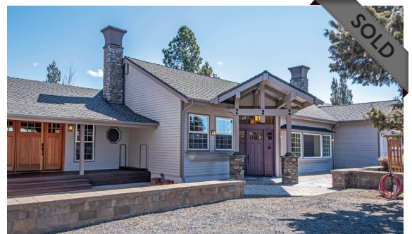
SISTERS OREGON 68879 Chestnut Drive #201906445 | $2,000,000