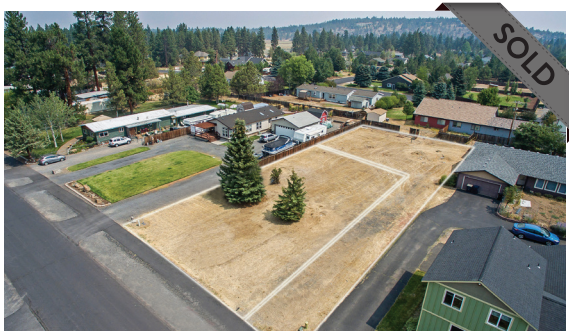
SISTERS OREGON 14960 Remuda Road #201910238 | $130,000