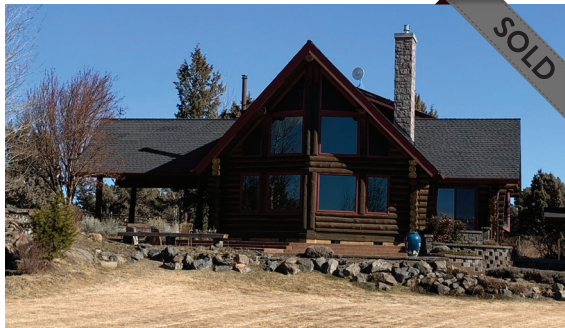
SISTERS OREGON 440 N Songbird Street #220100305 | $324,000