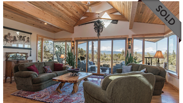
BEND OREGON 18201 Snow Creek Lane #202001703 | $1,585,000