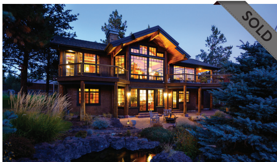
SISTERS OREGON 16747 Old Military Drive #201905205 | $1,447,000