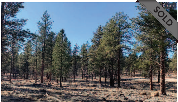
BEND OREGON 18117 Cascade Estates Drive #202003067 | $1,100,000