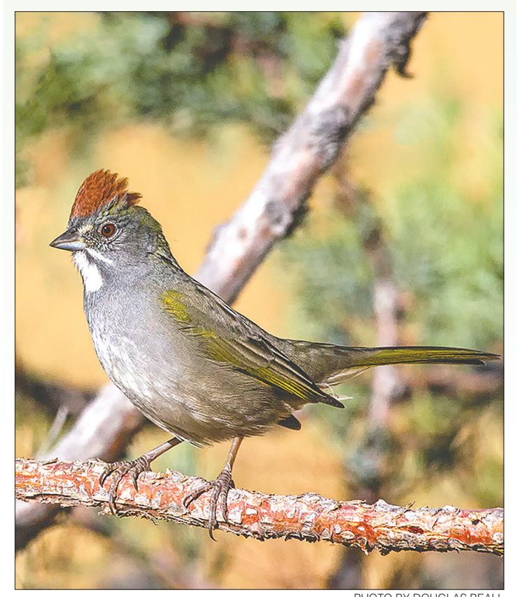
The Green-tailed Towhee.

A group of Towhees are collectively known as a "tangle" or a "teapot" of Towhees. For more Greentailed Towhee images, visit http://abirdsingsbecauseithasasong.com/recent-journeys.