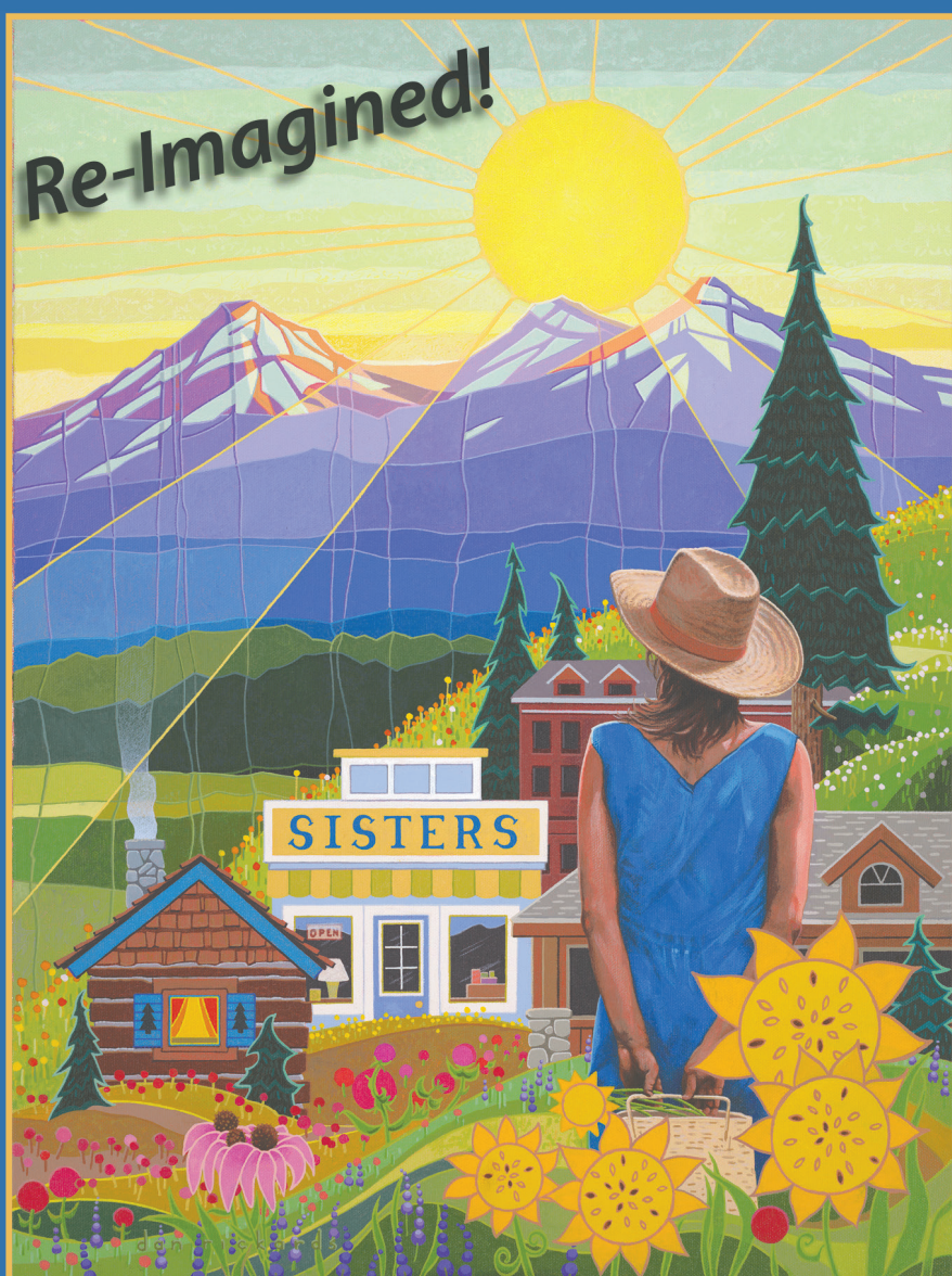
"MY KIND OF TOWN" BY DAN RICKARDS