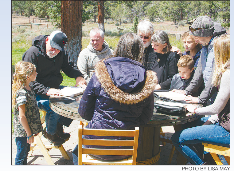
Vast Church continues to gather in smaller groups in backyards throughout Sisters.

routines can be used by God for His good purposes. Whether we continue to pause regular worship services, or even as we begin to