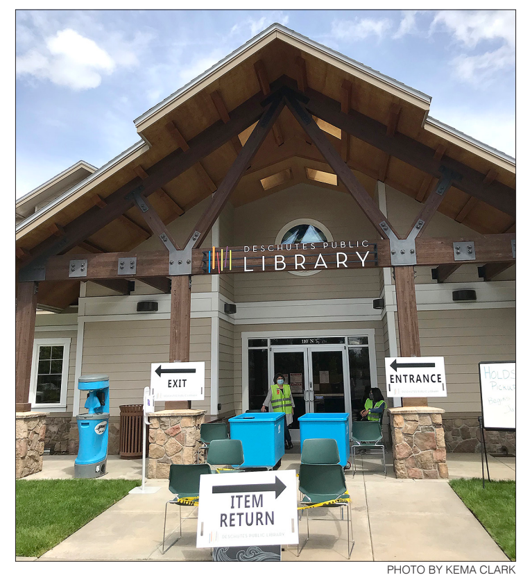
Library staff has begun the process of reopening the sorely-missed community asset.