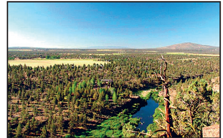
OVERLOOKS THE DESCHUTES RIVER

Located in the Coyote Springs neighborhood, end of a quiet cul-de-sac bordering the forest buffer, this homesite offers the best of both worlds. Access over 100 miles of Peterson Ridge and other forest trails right out your back door. Enjoy the nearby amenities of FivePine Lodge, Three Creeks Brewing, Sisters Athletic Club, Shibui Spa and Sisters Movie House or stroll into downtown to enjoy Creekside Park, the Village Green, art galleries, fine restaurants and gourmet markets. Ready for your new home with underground utilities, paved streets, city sewer and city water. CCRs and design guidelines have helped create a beautiful neighborhood of quality homes. Low HOA fees. Get your hiking shoes on or pull out your mountain bike and enjoy all that Sisters Country has to offer! $260,000. MLS#201910116