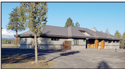
16575 JORDAN ROAD

Tile and bamboo flooring in the living areas help with easy maintenance in this 1,460 sq.ft. residence. Monitor oil heater provides low-cost heating in addition to electric heat. New lighting in dining area. Kitchen includes a breakfast bar. Bonus room for an office, mudroom or well-planned storage. New granite in the 2 bathrooms, newer carpet in the 3 bedrooms. Fenced backyard. Covered patio. This .6-acre lot borders public land. Pool, tennis, rec center & trails for homeowners. $349,000. MLS#202000173