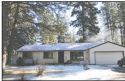
PAINT BRUSH SPECIAL

One-quarter shared interest in this beautiful 3-bedroom, 3-bath cabin at historic Lake Creek Lodge in Camp Sherman. Features modern amenities with the feel of yesteryear. Built in 2011, and furnished with a combination of antiques and quality reproduction pieces. The cabin features fir plank floors, knotty pine paneling, stone/gas fireplace, butcher block countertops, gas cooktop, farm kitchen sink, tile bathroom floors and showers, washer/dryer, cedar decks, stone exterior accents and locked owner storage. $215,000. MLS#201908128