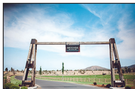
HIGH DESERT LIVING AT ITS FINEST

Spacious 3,598 sq. ft., 5+ bedroom /5.5-bath home perched high above Glaze Meadow 12th green & fairway & the 13th fairway with Mt. Jefferson & Black Butte views. Updated in 2017, featuring open greatroom, gourmet kitchen, separate family room, river rock fireplace & oak hardwood floors. Warm natural wood paneling & steamed European birch & cherry wood cabinets throughout, natural polished stone slab countertops. Four master suites, each with private bath, additional bedroom & bonus room, could be 6th bedroom, each sharing 5th bathroom. Large utility room & staging area with 1/2 bath, storage & workshop. Attached double garage & extensive decking for outdoor living on all sides of the home. $1,650,000. MLS#201905530