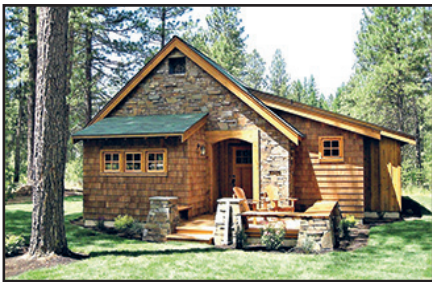
LAKE CREEK LODGE, #27-U3

One-quarter shared interest in this beautiful 3-bedroom, 3-bath cabin at historic Lake Creek Lodge in Camp Sherman. Features modern amenities with the feel of yesteryear. Built in 2011, and furnished with a combination of antiques and quality reproduction pieces. The cabin features fir plank floors, knotty pine paneling, stone/gas fireplace, butcher block countertops, gas cooktop, farm kitchen sink, tile bathroom floors and showers, washer/dryer, cedar decks, stone exterior accents and locked owner storage. $215,000. MLS#201908128