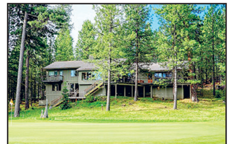
GOLF COURSE & MOUNTAIN VIEWS

This premier building site is perched like an eagle's nest on the west rim of the Deschutes River Canyon. Beautiful river views and views of Smith Rock, the Ochocos and the southern horizon. Paved access, existing well, utilities and septic available. Property directly fronts the Deschutes River, and BLM lands are nearby offering hiking and/or fishing opportunities. $295,000. MLS#201506294