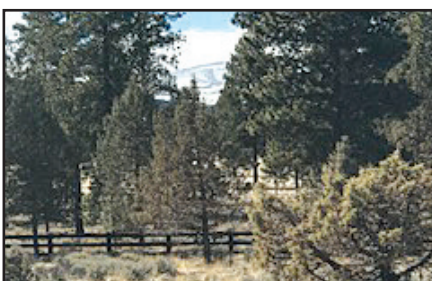
16676 JORDAN ROAD

Three bedrooms, 2.5 baths. Ultra-modern interior design features upper-level living. Light and bright greatroom with south-facing windows, cozy propane fireplace and high vaulted ceilings. Sunny patio with mountain view and feeling of openness. Comfortable upper-level master suite with high ceilings, plenty of closet space and spacious bathroom. Also, a half-bath plus utility room upstairs for convenience. Lower level has 2 bedrooms plus guest bathroom. Heat pump on upper and efficient in-floor radiant heating on lower level. Single attached garage. $449,000. MLS#202000010