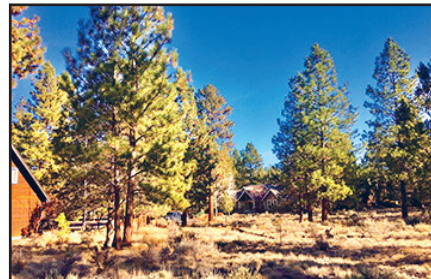
THE BEST OF BOTH WORLDS

Located in the Coyote Springs neighborhood, end of a quiet cul-de-sac bordering the forest buffer, this homesite offers the best of both worlds. Access over 100 miles of Peterson Ridge and other forest trails right out your back door. Enjoy the nearby amenities of FivePine Lodge, Three Creeks Brewing, Sisters Athletic Club, Shibui Spa and Sisters Movie House or stroll into downtown to enjoy Creekside Park, the Village Green, art galleries, fine restaurants and gourmet markets. Ready for your new home with underground utilities, paved streets, city sewer and city water. CCRs and design guidelines have helped create a beautiful neighborhood of quality homes. Low HOA fees. Get your hiking shoes on or pull out your mountain bike and enjoy all that Sisters Country has to offer! $260,000. MLS#201910116