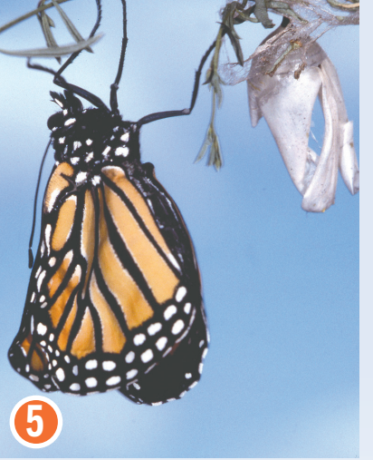
Life and times of the monarch butterfly: 1, monarch egg; 2, larva; 3, pupating; 4, chrysalis; 5, emerging.