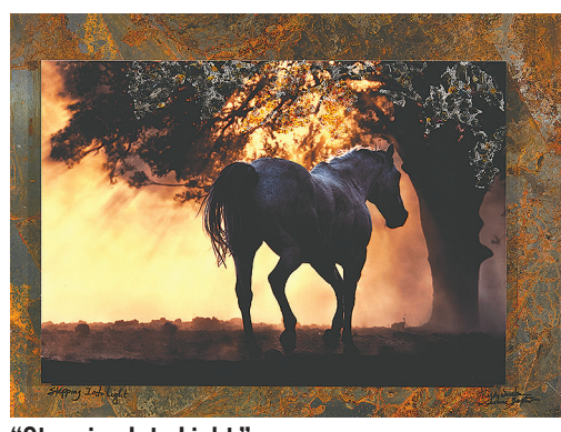
"Stepping Into Light."

Smith Rock State Park. Since I have a view of Smith Rock from home it is an ongoing inspiration. Whether I am painting landscapes or interior studies, I am always conscious of the beauty of solitude. During this time of social distancing it has become a strength."