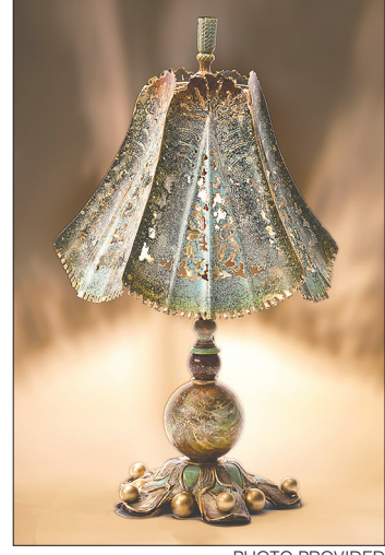
Five Panels, Five Leaves Lamp by Ken Scott, metal sculptor.

The virtual auction will open on Friday, May 8 and close on Saturday, May 16, with more than 70 different items coming up for bid during that time. No ticket purchase is necessary to participate in the auction, and bids