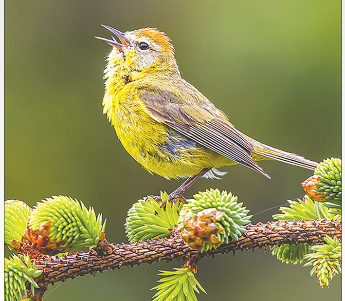
Orange-crowned warbler, showing an exceptional amount of his namesake color.

For more orangecrowned warbler photos visit http://abirdsings becauseithasasong.com/ recent-journeys.