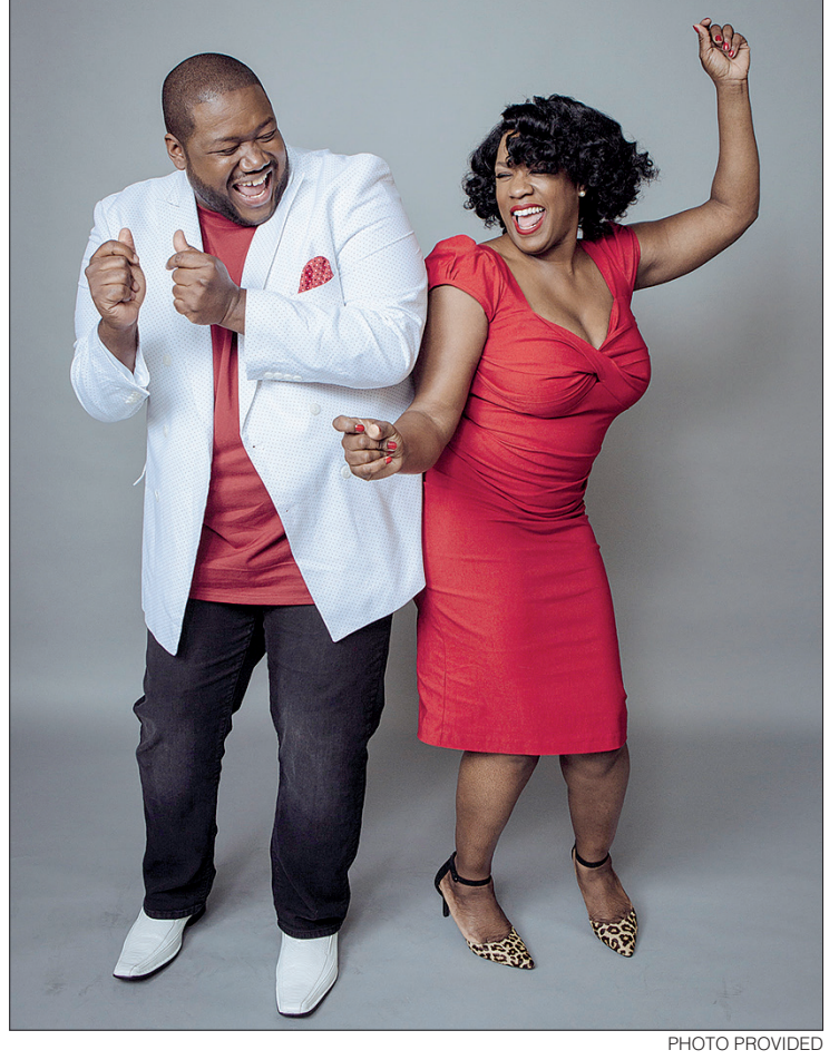
The War and Treaty will take the stage at this year's Sisters Rhythm and Brews Festival.

Formed 16 years ago by the members of Grammy Award-winning Latin revival orchestra Groupo Fantasia, Brownout is a feverishly eclectic octet based in Austin, Texas, that combines funk, rock, cumbia and jazz. For this year's Festival they will be playing a 90-minute set of reinterpreted classic