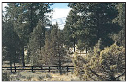
16676 JORDAN ROAD

This premier building site is perched like an eagle's nest on the west rim of the Deschutes River Canyon. Beautiful river views and views of Smith Rock, the Ochocos and the southern horizon. Paved access, existing well, utilities and septic available. Property directly fronts the Deschutes River, and BLM lands are nearby offering hiking and/or fishing opportunities. $295,000. MLS#201506294