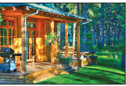
LAKE CREEK LODGE, #18

Located in the Coyote Springs neighborhood end of a quiet cul-de-sac bordering the forest buffer, this homesite offers the best of both worlds. Access over 100 miles of Peterson Ridge and other forest trails right out your back door. Enjoy the nearby amenities of FivePine Lodge, Three Creeks Brewing, Sisters Athletic Club, Shibui Spa and Sisters Movie House or stroll into downtown to enjoy Creekside Park, the Village Green, art galleries, fine restaurants and gourmet markets. Ready for your new home with underground utilities, paved streets, city sewer and city water. CCRs and design guidelines have helped create a beautiful neighborhood of quality homes. Low HOA fees. Get your hiking shoes on or pull out your mountain bike and enjoy all that Sisters Country has to offer! $260,000. MLS#201910116