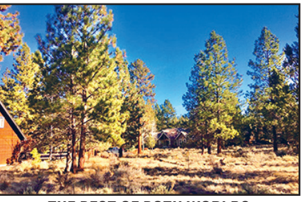
THE BEST OF BOTH WORLDS

Three bedrooms, 2.5 baths. Ultra-modern interior design features upper-level living. Light and bright greatroom with south-facing windows, cozy propane fireplace and high vaulted ceilings. Sunny patio with mountain view and feeling of openness. Comfortable upper-level master suite with high ceilings, plenty of closet space and spacious bathroom. Also, a half-bath plus utility room upstairs for convenience. Lower level has 2 bedrooms plus guest bathroom. Heat pump on upper and efficient in-floor radiant heating on lower level. Single attached garage. $449,000. MLS#202000015