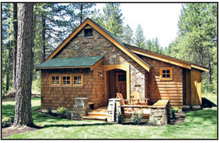
LAKE CREEK LODGE, #27-U3

Options: 1/4 share $219,000, MLS#201811624 (or) 1/2 share, $429,000, MLS#201811627