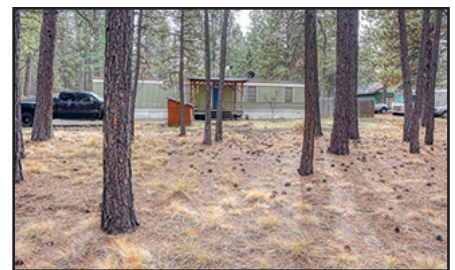
14892 BLUEGRASS LOOP

One-third ownership! Enjoy an open floor plan with views of pine trees from the living room, featuring stone fireplace, vaulted ceilings, kitchen and dining room. Three bedrooms, 2 baths, master on ground floor, offering a private retreat for guests or a place for kids to hang out. Huge windows provide abundant natural light. Loft for additional sleeping area. Wood detail throughout. Black Butte Ranch amenities include restaurants, golf courses, spa, indoor and outdoor pools and hot tubs, fitness facilities, tennis and pickleball courts, hiking and biking trails, & more! $185,500. MLS#201909261