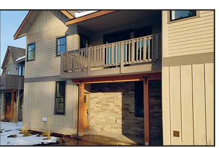
EXCITING NEW TOWNHOME

...homesite in Aspen Lakes Golf Estates. 1.27 acres with nice pine trees and water views. Protective CCRs in this gated community of fine homes. Utilities to the lot line. Just minutes to the town of Sisters. $379,500. MLS#201506535