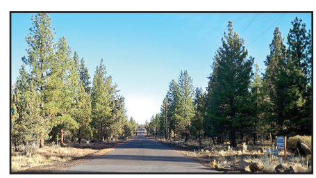
YOU BELONG HERE

Mountain views! Part of the original Lazy Z Ranch. Fenced on two sides with Kentucky black fencing. Power close by. Septic feasibility in place, may need new evaluation. Close to town, yet off the beaten path, overlooking a 200-acre site of the R&B Ranch, which currently is not buildable. Needs well. Owner will consider short terms. $385,000. MLS#201802331