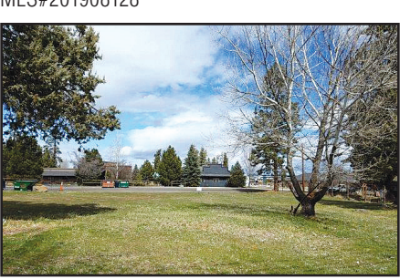
343 W. ADAMS AVE.

One-quarter shared interest in this beautiful 3-bedroom, 3-bath cabin at historic Lake Creek Lodge in Camp Sherman. Features modern amenities with the feel of yesteryear. Built in 2011, and furnished with a combination of antiques and quality reproduction pieces. The cabin features fir plank floors, knotty pine paneling, stone/gas fireplace, butcher block countertops, gas cooktop, farm kitchen sink, tile bathroom floors and showers, washer/dryer, cedar decks, stone exterior accents and locked owner storage. $215,000. MLS#201908128