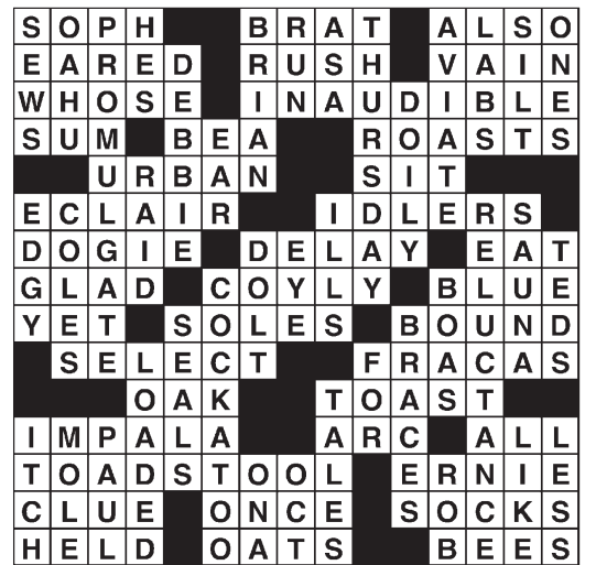
©2020 Tribune Content Agency, LLC All Rights Reserved. 1/30/20